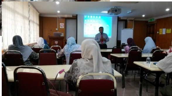
H-Index Workshop – 27 May 2014, Seminar Room, Block A, Faculty of Educational Studies.